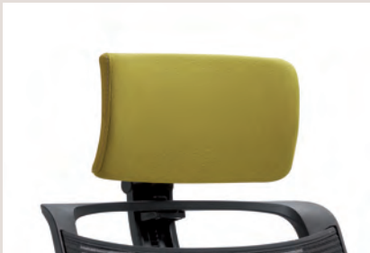
Poggiatesta regolabile in altezza imbottito. Height adjustable headrest padding.