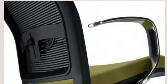
Poggiareni regolabile. Adjustable lumbar support.