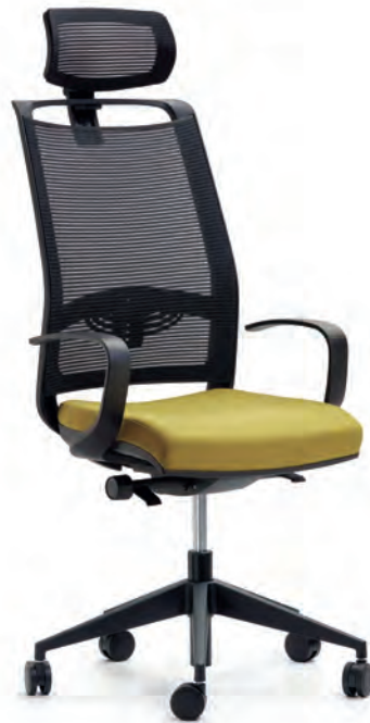
GIULIA 200 EXECUTIVE CHAIR