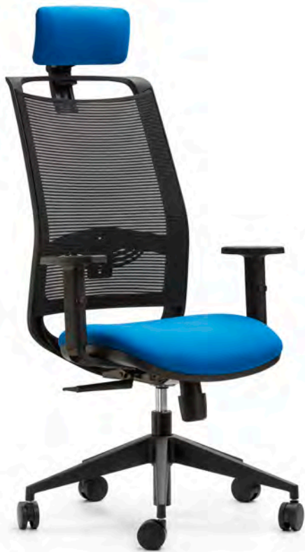
GIULIA 100 EXECUTIVE CHAIR