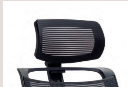
Poggiatesta regolabile in altezza rete. Height adjustable headrest mesh.