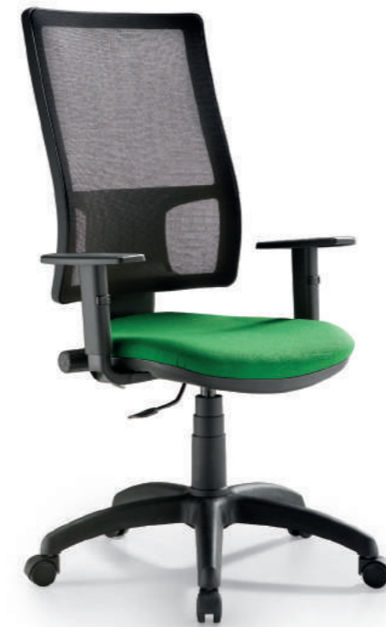
WING OPERATIVE CHAIR